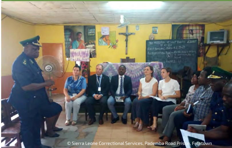
Pademba Road Prison, Freetown

Sierra Leone retains the death penalty for aggravated robbery, murder, treason and mutiny. Although a de facto moratorium is in place with the last executions taking place in October 1998, death sentences are still routinely pronounced. At the end of 2020, there were 78 persons on death row, an increase of over 50% from August 2019. Recent sentences from the Kabala High Court Criminal session in September 2020 saw one woman sentenced to death. The EU, together with AdvocAid and like-minded partners, is committed to the abolition of the death penalty by advocating improved access to legal representation and effective right to appeal for prisoners on death row, as well as by promoting legal reforms in view of the in law abolition of the mandatory death penalty sentence.