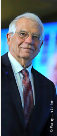
Josep BORRELL High Representative of the European Union for Foreign Affairs and Security Policy

2020 was undoubtedly a challenging year. The COVID-19 global pandemic not only put our health and lives at risk, but also exacerbated economic and social inequalities, led to an increase in domestic violence and hampered the right to education for many children. We witnessed the shrinking of civic space, the flourishing of disinformation and authoritarian trends growing.