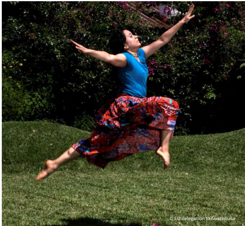
The first Guatemalan woman to win the scholarship Erasmus Mundus Joint Master Degree: Choreomundus - International Master in Dance Knowledge, Practice, and Heritage. Erasmus+.

In 2020 alone, the EU supported cultural projects, with over EUR 20 million in funds.