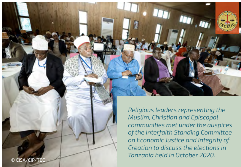
Religious leaders representing the Muslim, Christian and Episcopal communities met under the auspices of the Interfaith Standing Committee on Economic Justice and Integrity of Creation to discuss the elections in Tanzania held in October 2020.

The Intercultural Learning Exchange through Global Education, Networking and Dialogue (iLEGEND) joint programme of the EU and the Council of Europe shared similar objectives by fostering intercultural dialogue, participation, capacity building and exchange of good practices.