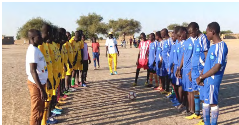
A football match in Warou on the occasion of the Peace Tournament, which raised awareness amongst 600 people about violence against children, the culture of peace and the link between religious and formal schools.