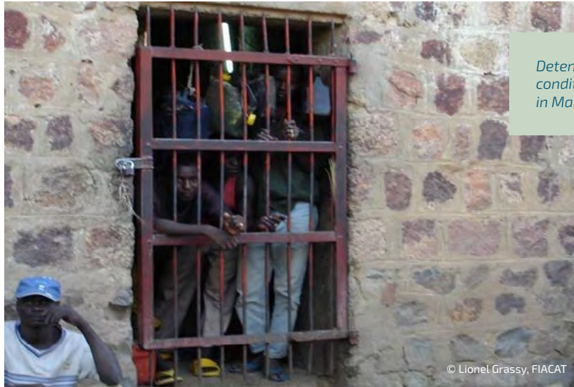
Detention conditions in Mali