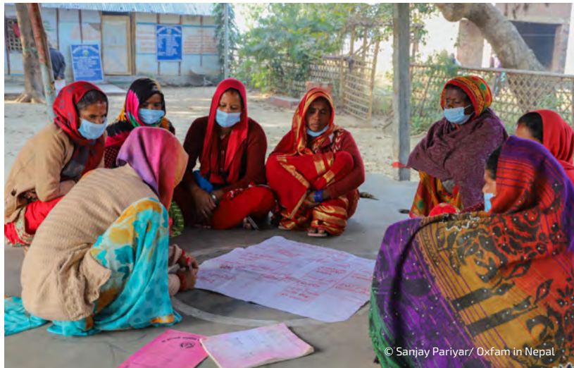
Members from Community Forestry Users Group discussing the development of climate resilient actions to adapt to adverse impacts of climate change and to reduce disaster risks in Tiruth Rural Municipality in Nepal.

On 28 September 2020, on the margins of the UNGA, the EU co-organised a high-level leaders' event, at which it launched the 'Leaders Pledge for Nature' 43 . The Pledge, endorsed by 76 countries, contains significant commitments at the highest political level to put nature, climate and the environment at the heart of recovery strategies and decision-making. The Pledge is also a statement of intent in support of the post-2020 Global Biodiversity Framework to be agreed at the Biodiversity COP15 and in anticipation of the COP26 UN Climate Change Conference in 2021.