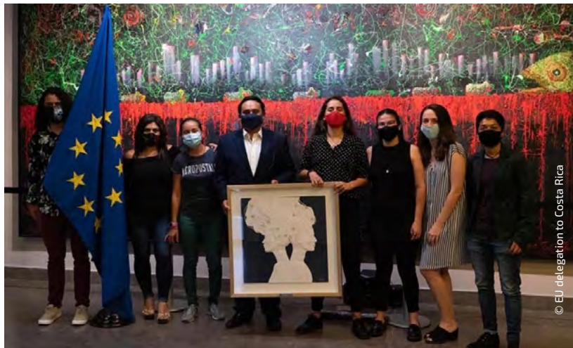
Members of Fundacion GOLEES – recipients of Second edition of EU Gender Equality Award in Costa Rica.

foundations, the private sector, awareness-raising campaigns and advocacy events. Furthermore, specific initiatives were undertaken to address existing inequalities and multiple and intersecting forms of discrimination against women and girls, which are often entrenched and systemic, to eliminate all forms of sexual and gender-based violence, and to promote women's and girls' full and equal enjoyment of all human rights and their empowerment, active, full, effective, free and meaningful participation.