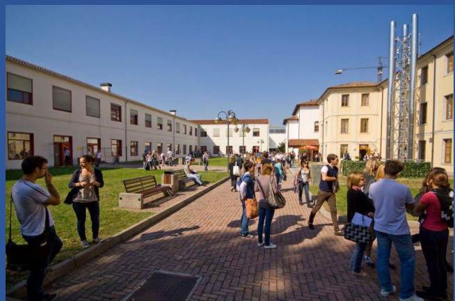
University of Udine