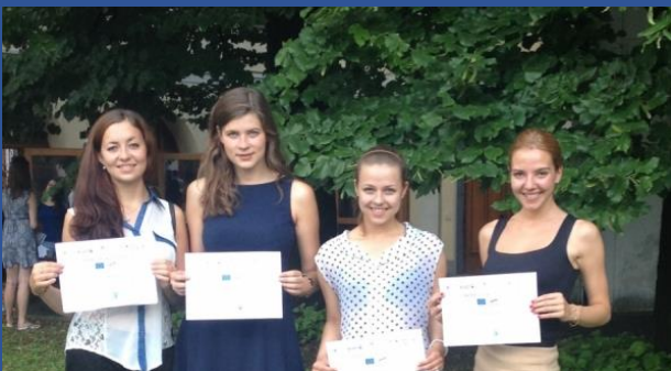
Students holding the certificate of attendance at the 2013 edition