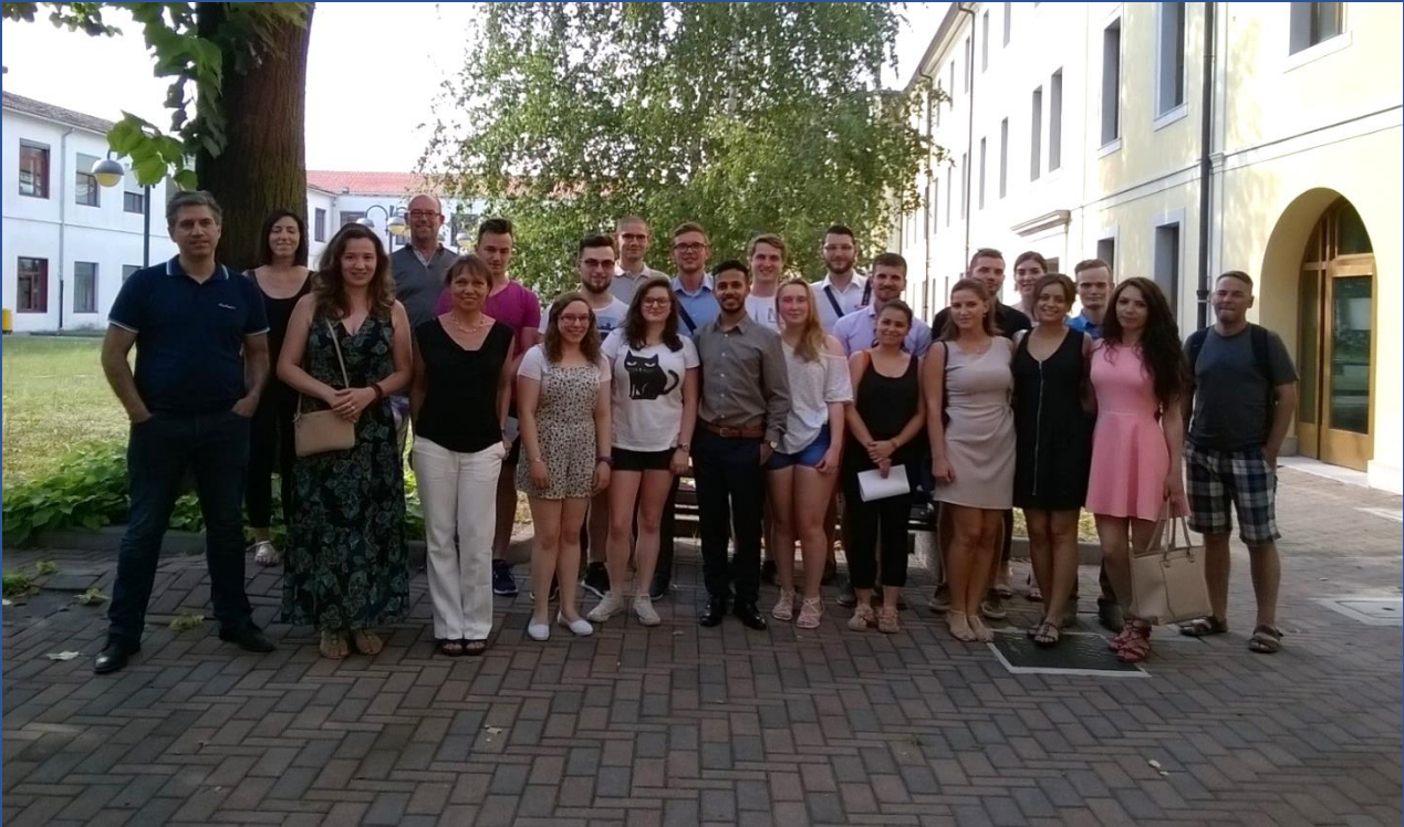
2016 Summer school participants and teachers