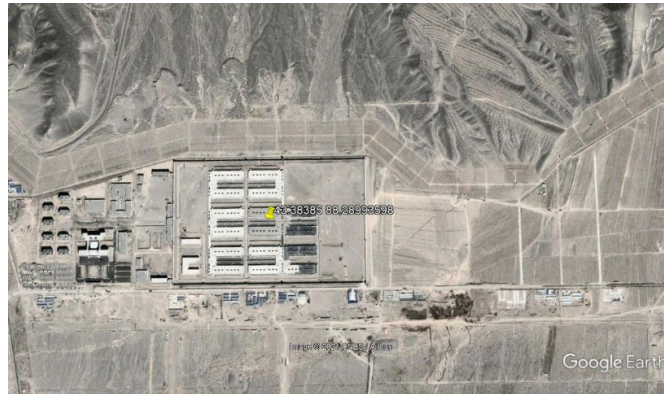
22 April 2018 (image available on Google Earth)