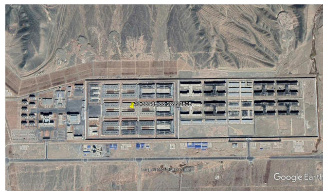
19 March 2020 (image available on Google Earth)

64. OHCHR examined a cross-sample of available judicial decisions in cases alleging terrorism or “extremism” with respect to defendants from ethnic communities in XUAR in the period 2014-2019. The number of publicly available and relevant court decisions is limited and may not necessarily be representative of the totality of judicial practice, but those that are available provide important insights into the way the judiciary has interpreted acts of religious “extremism”. 150 These include relatively minor infractions apparently punished severely; judgments referring to conduct being “extremist” despite none of the formal charges being related to terrorism or “extremism”; courts labelling acts as “extremist” without explaining how they fulfilled the applicable legal definition(s); the apparent targeting of underlying religious behaviour rather than the actual act for which the person is being prosecuted; and indications of an approach that considers any type of violation of law committed by a Muslim person as presumptively “extremist”.