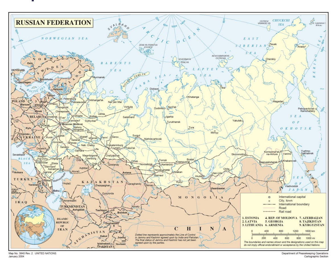
Map 1. The Russian Federation<sup>10</sup>