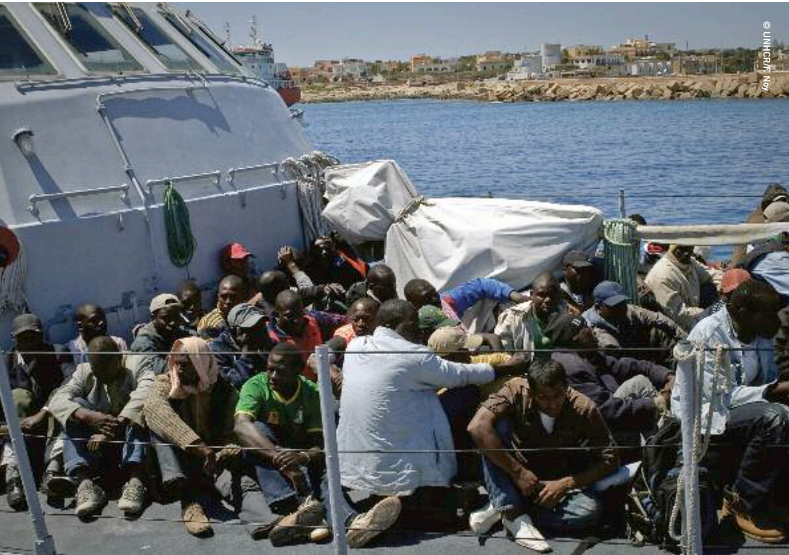
These people were among almost 500 people rescued from a skiff in the Mediterranean Sea and taken by six Italian boats to Lampedusa, Italy, May 2011.