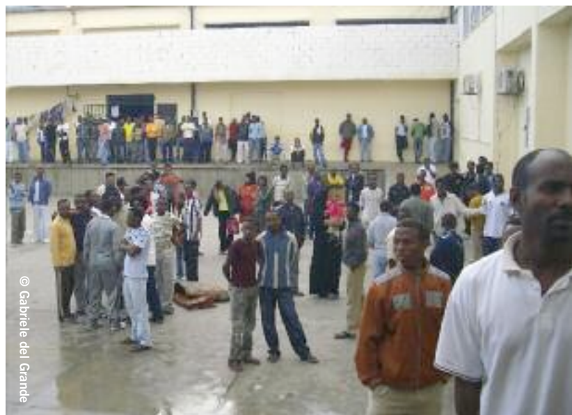
Refugees and migrants in the yard at Misratah Detention Centre, Libya, November 2008.

Research by Amnesty International and other human rights groups has exposed widespread abuses against refugees, asylum-seekers and irregular migrants in Libya during Colonel al-Gaddafi’s rule, as well as during and following the conflict that deposed him. 4 Documented violations and abuses include indefinite detention in extremely poor conditions, beatings and other ill-treatment, in some cases amounting to torture. Refugees and asylum-seekers also face a real risk of refoulement (being returned to a country where they are at risk of persecution or serious human rights abuses). Libya is not a party to the 1951 UN Convention relating to the Status of Refugees and its