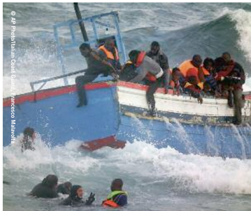
Italian Coast Guard scuba divers, seen bottom left, rescue migrants in Pantelleria, Italy, 13 April 2011. Officials say two women drowned while attempting to reach Italy from North Africa after their boat with 250 people aboard went off course and ran aground just off an Italian island.

States must be held accountable for the human rights abuses committed in the context of externalization. A lack of transparency surrounding many European countries’ border management practices and agreements with third countries means that the violations continue unchecked. In the permissive environment created by this lack of scrutiny, migrants, refugees and asylum-seekers are denied any protection of their rights.